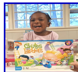
A favorite activity