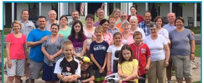
The Summer Weekend Away at Shrine Mont