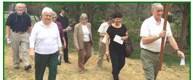
Walking the Stations of the Cross.