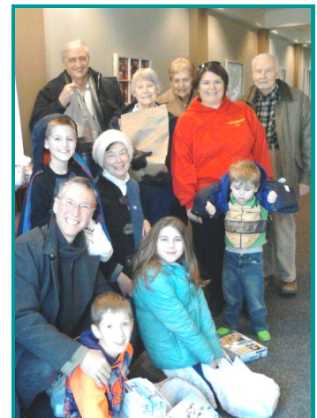
Neighbors Helping Neighbors Food Drive