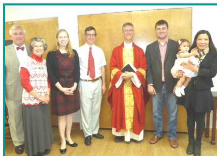
A Baptism on Pentecost