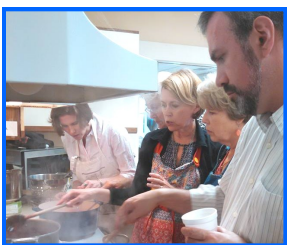
Making jam to sell at the Fair.