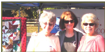
St. James' at the St. Luke's Fair